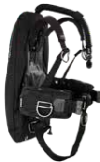
18lb donut with Ultralight Travel Plate, Deluxe One-Piece Webbed Harness, SureLock™ Attachments and SureLock™ Pockets.