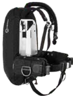
30lb donut with aluminum back plate, Deluxe One-Piece Webbed Harness, SureLock™ Attachments and SureLock™ Pockets.