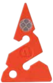
Directional Line Marker