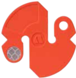
Cookie Line Marker