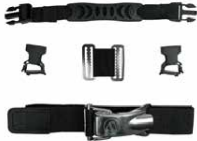
Twin Cylinder Kit available separately