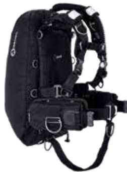
40lb donut with WTX Harness and SureLock™ Pockets.