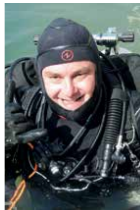
Etienne Mackensen Germany