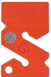
Non-Directional Line Marker